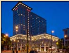
Lancaster Marriott at Penn Square

is now open. The state-of-the-art, 299-room Marriott is a wonderful addition to the county. The property is close to all of the city's dining, shopping, and artistic offerings, while being right in the midst of the historic sites, surrounding farmlands, and Amish heritage for which Lancaster County is famous.