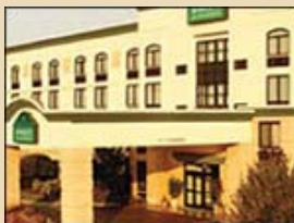
Wingate Inn by Windham

A new, 70-room Wingate Inn by Windham opened recently. It is located on Lincoln Highway East (Route 30) near Tanger Outlets .